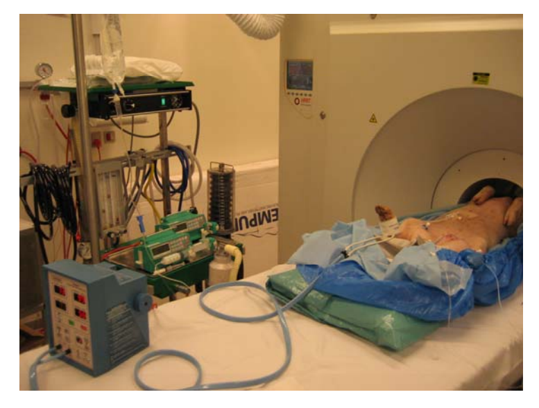
Figure 2. The experimental set-up in which novel Cimbi PET radioligands are tested in the living pig brain. Animal are anaesthetized, intubated and ventilated during all procedures. Vital signs are monitored throughout the duration of the PET scanning. Immediately after scanning, the animals are sacrificed under full anesthesia.

experimental animal to test the in vivo properties of novel PET tracers was made very early. The Danish Landrace pig is a good alternative to monkeys, as a large animal species that resembles humans in many aspects. Specifically, large size of the pig brain favors PET imaging using standard equipment designed for human use (Figure 2). Compared to monkeys, pigs are also easier to house and handle, and they are readily available from industrial farms in Denmark.